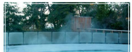
Before Heatsavr™ 8:00 AM