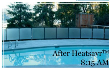
After Heatsavr™ 8:15 AM

the liquid solar pool cover for all shapes and sizes of indoor or outdoor pools